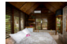
Bedroom in Pisces