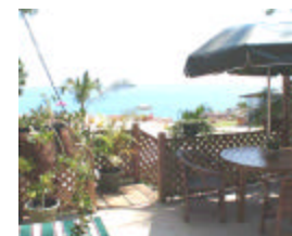
View from Gemini